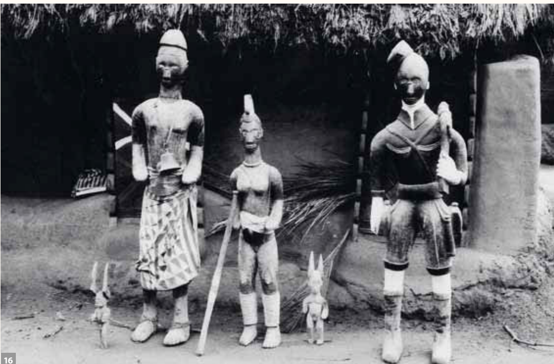
Five shrine figures including the "chief" (left), a deity named Eze Imeke of Umudioka Neni, called "founder" of Umudioka village but a general tutelary spirit. Figures are members of his family - his wife and "police" son. Both males have ikenga.