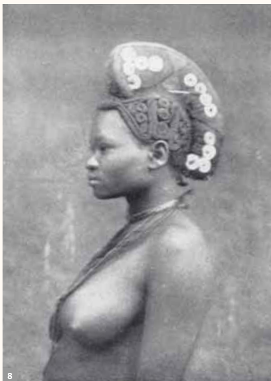
A young lady from Awka