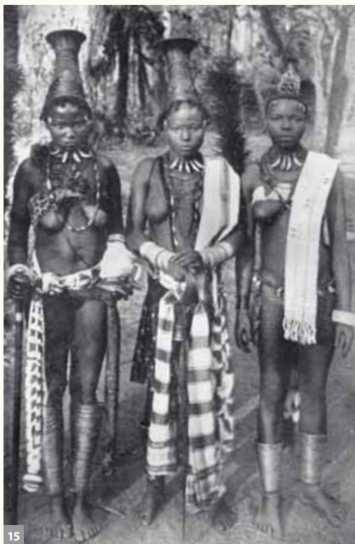
15 Prospective brides of chiefs. The staves and ivory bracelets are loans from their future husbands.