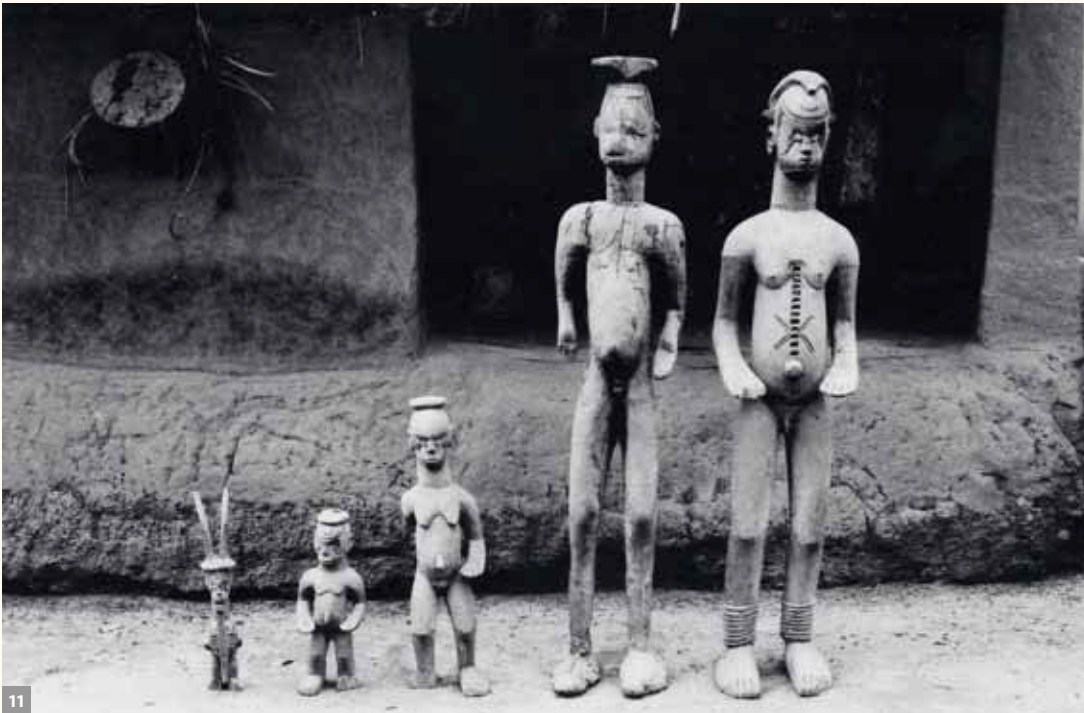
Ezeiyi (tutelary god) and family. Far right carved circa 1910, a replacement for second from right perhaps mid 19 th century, kept for the village of Umumri Neni by the Umuo Kaezeduku family. Smaller figures are Ezeiyi's son (smaller) and daughter, and of course ikenga . Photo : Herbert Cole, 1966