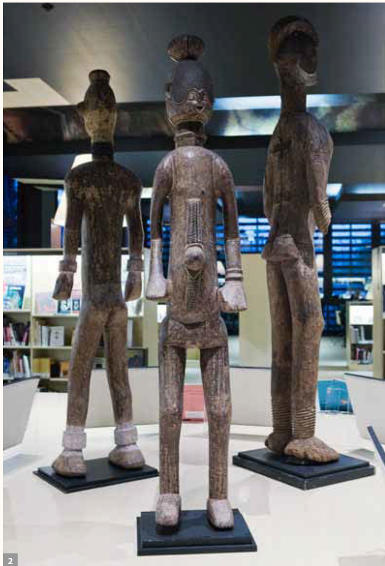
Photo d'un groupe de statue Ibo, salon de lecture Jacques Kerchache Musée du quai Branly, Paris