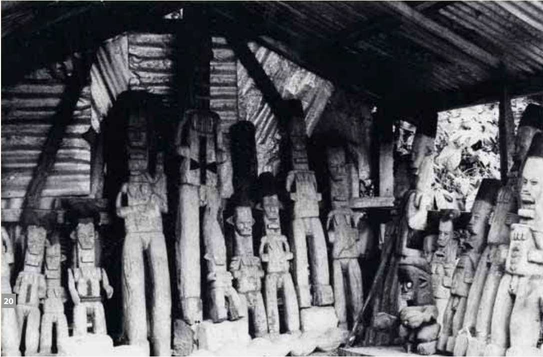
Family, genre figures and animals in Iyiafo shrine in Mbieri.

Collection privée, Angleterre, avant 1969