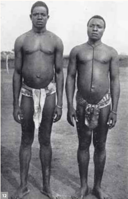
Young Igbo men.